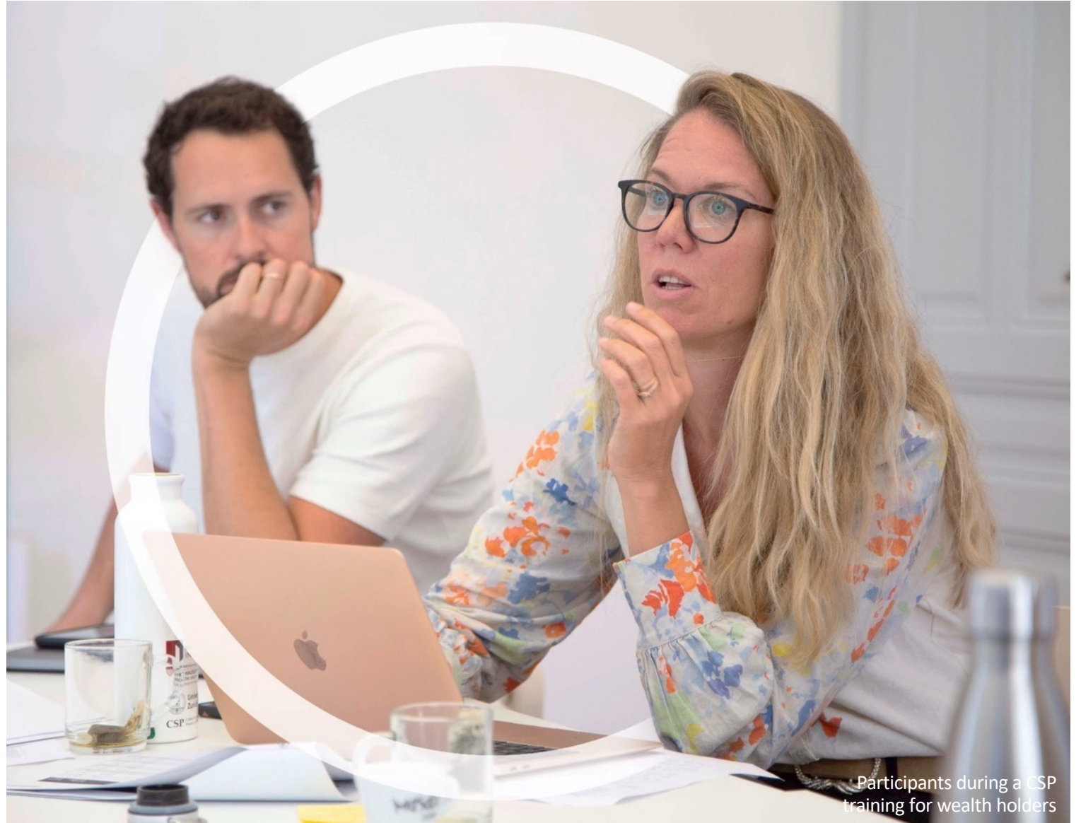
Participants during a CSP training for wealth holders

An overview of CSP's training programs for Wealth Holders and Wealth Managers