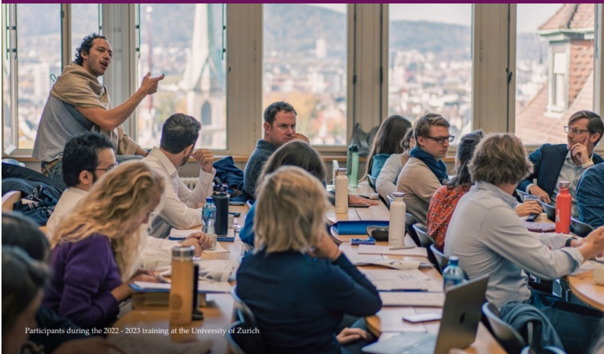
Participants during the 2022 - 2023 training at the University of Zurich